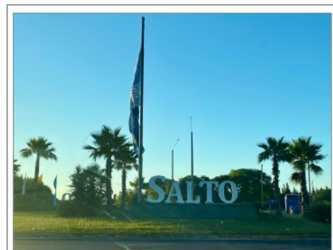
Happy to be home again!

miles through 38 states and 9 provinces in 7 months. (We came very close to having several serious accidents along