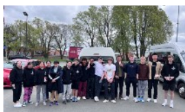
YOUTH CAMP WE TOOK 16 TEENS TO YOUTH CAMP THIS YEAR - OUR BIGGEST EVER!