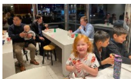
AFTER CHURCH KFC OUR CHURCH FAMILY ENJOYS A DINNER TOGETHER AFTER SERVICES