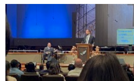
HOME CHURCH VISIT REPORTING BACK TO OUR HOME CHURCH ON A BRIEF VISIT