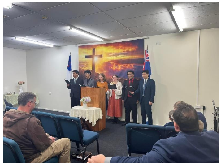
NZBBTP Students Singing