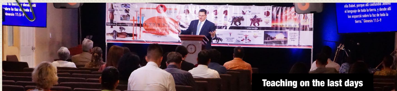
Teaching on the last days