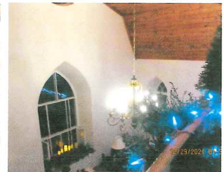
front window taken from balcony