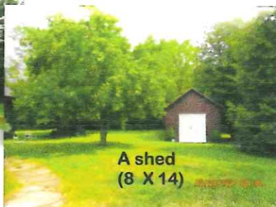
A shed (8 X 14)