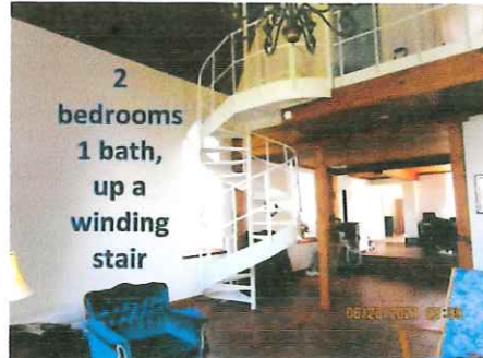
2 bedrooms 1 bath, up a winding stair