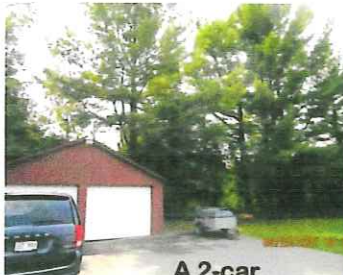
A 2-car garage