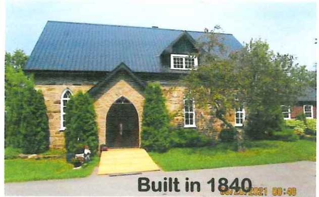
Built in 1840