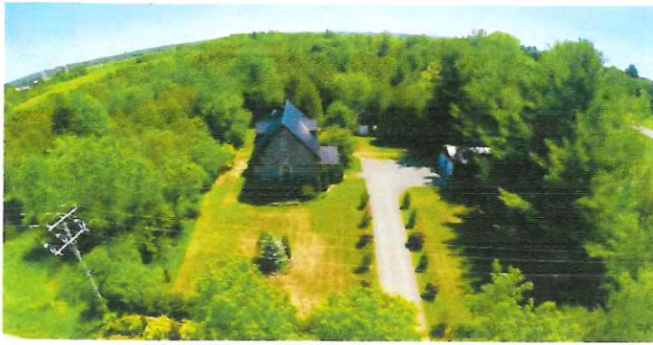
Lot area: 37, 000 square feet