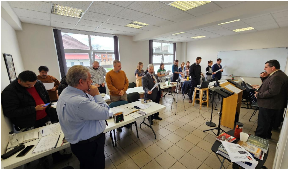
Chapel during the Baptist History Modular