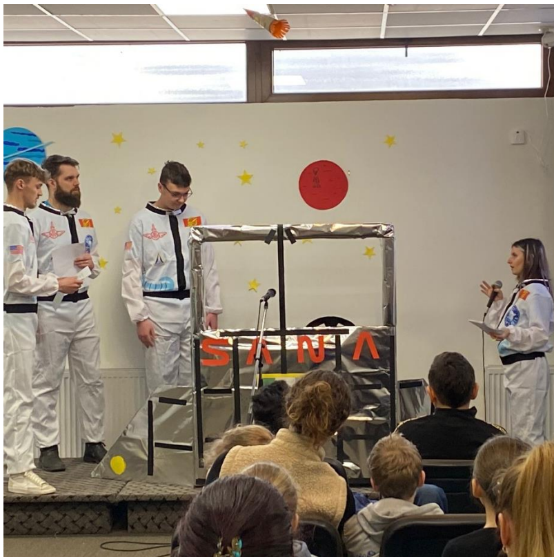
Having fun with the skit during Christian Children's Club