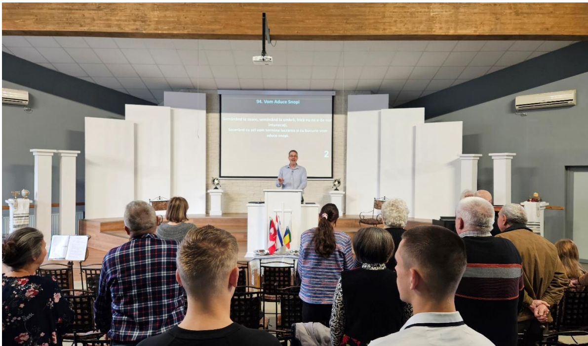
The Sunday service in Cluj on the March 17 th