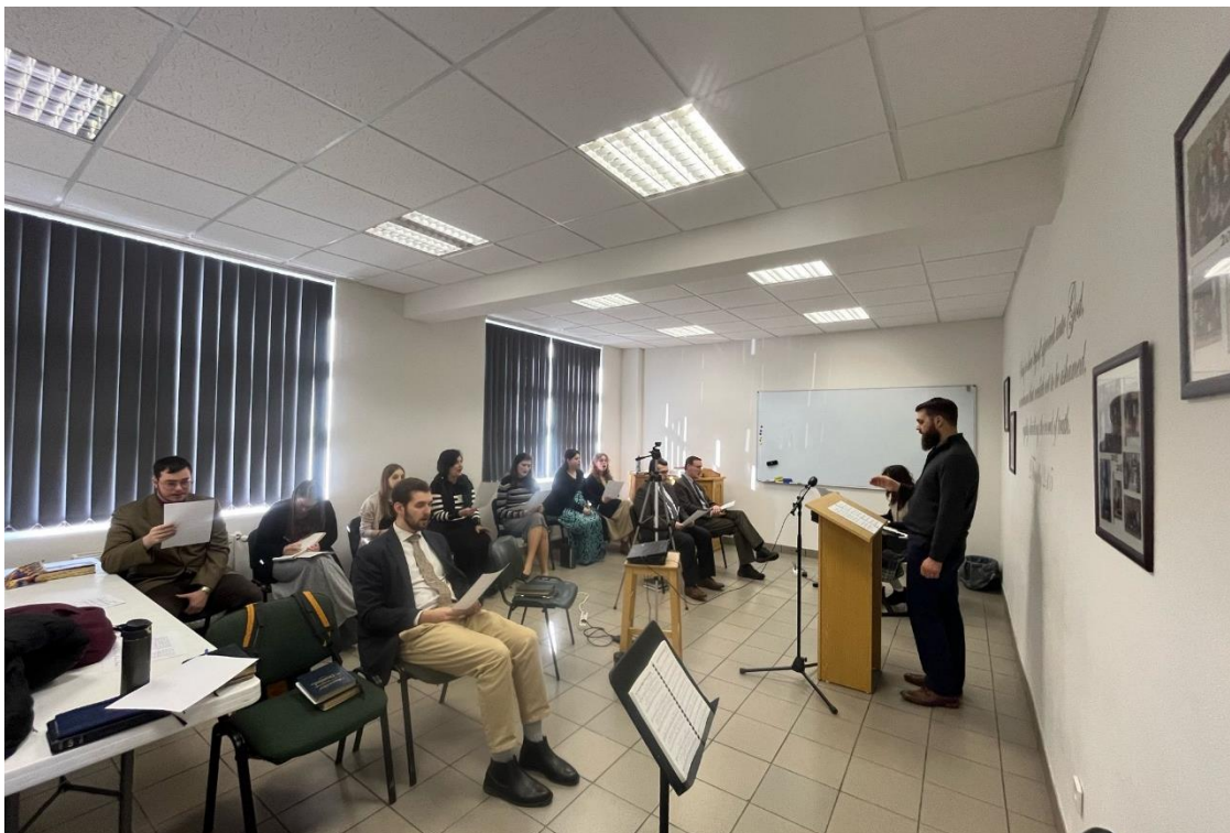
College Chapel during the first week of school