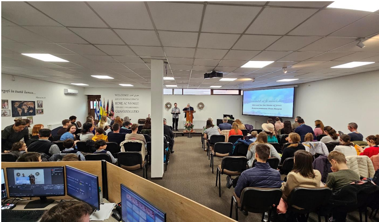
We have been running around 80 on Sundays.