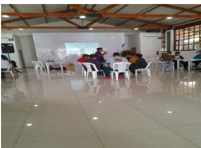
Men's event in Milagro