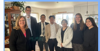
NZ Baptist Bible Training students