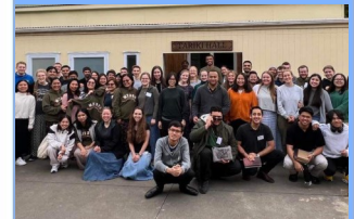
Young Adult Retreat 2024