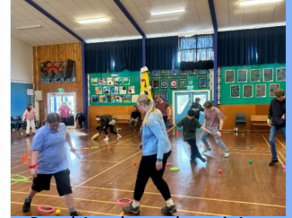
Combined youth activity.