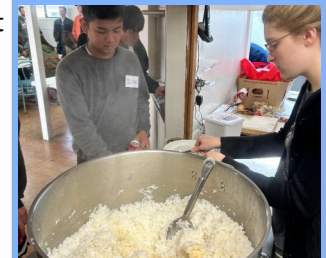
Young Adult Retreat—Rice