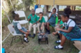
Four of my five students had their birthday in December and we celebrated with roasted hotdogs.