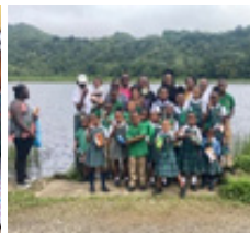
End of school term bus trip. We had a great time interacting with the mono monkey.