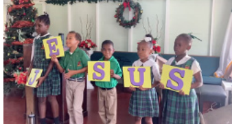
A mini-Christmas play at the assembly from my class

Highlights at Lifeline Baptist Christian Academy: