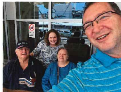
Mom and Dad