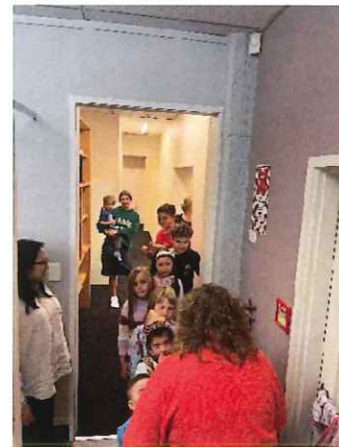
Good Friday Kids Activity