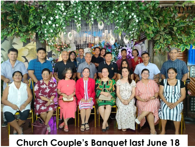
Church Couple's Banquet last June 18