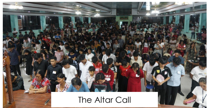
The Altar Call