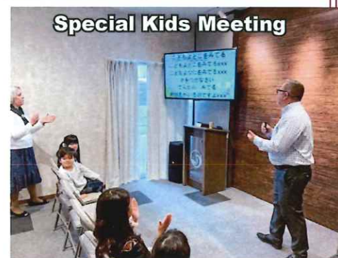
Special Kids Meeting