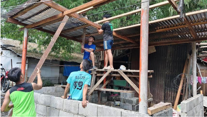
Students putting on the roof.