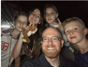
Kids at camp

As the hymn states, "To God be the glory... great things He hath done," so rings out our voices to God. The last three months have been such a blessing and encouragement to us. Rejoice with us in the Lord's working.