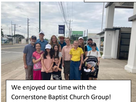
We enjoyed our time with the Cornerstone Baptist Church Group!