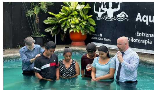
Four were baptized!